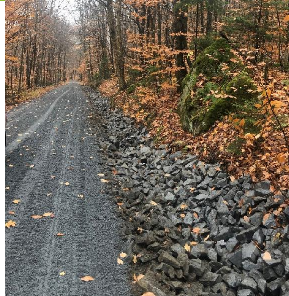
Willoughby State Forest