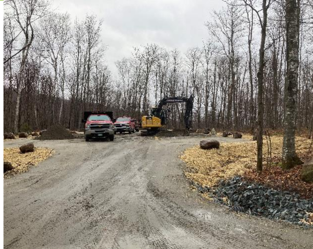
Owl's Head Trail New Parking Area – Groton State Forest