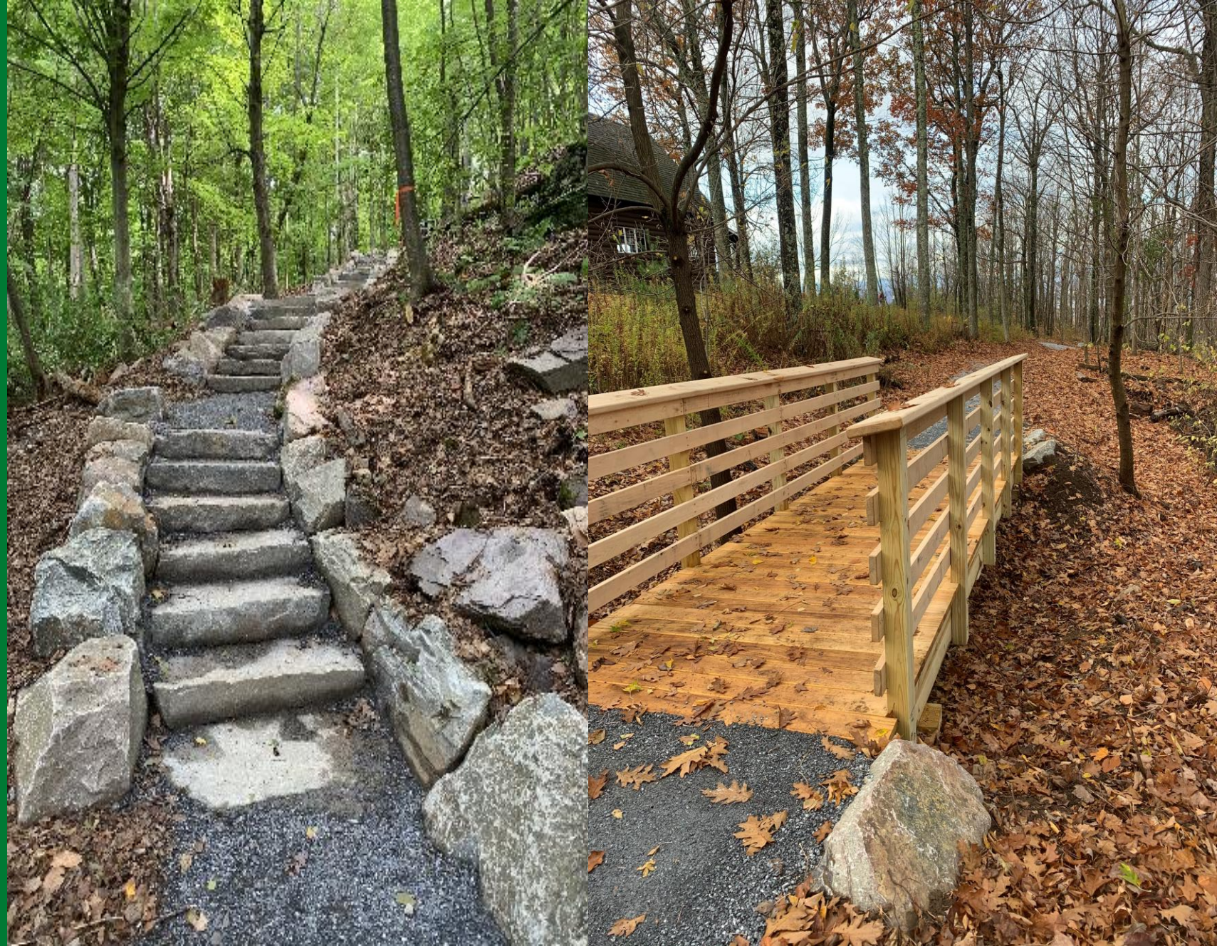
Mt. Philo State Park Summit Trail