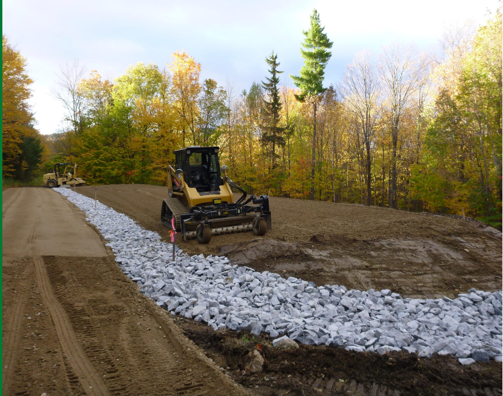
Camel's Hump State Park