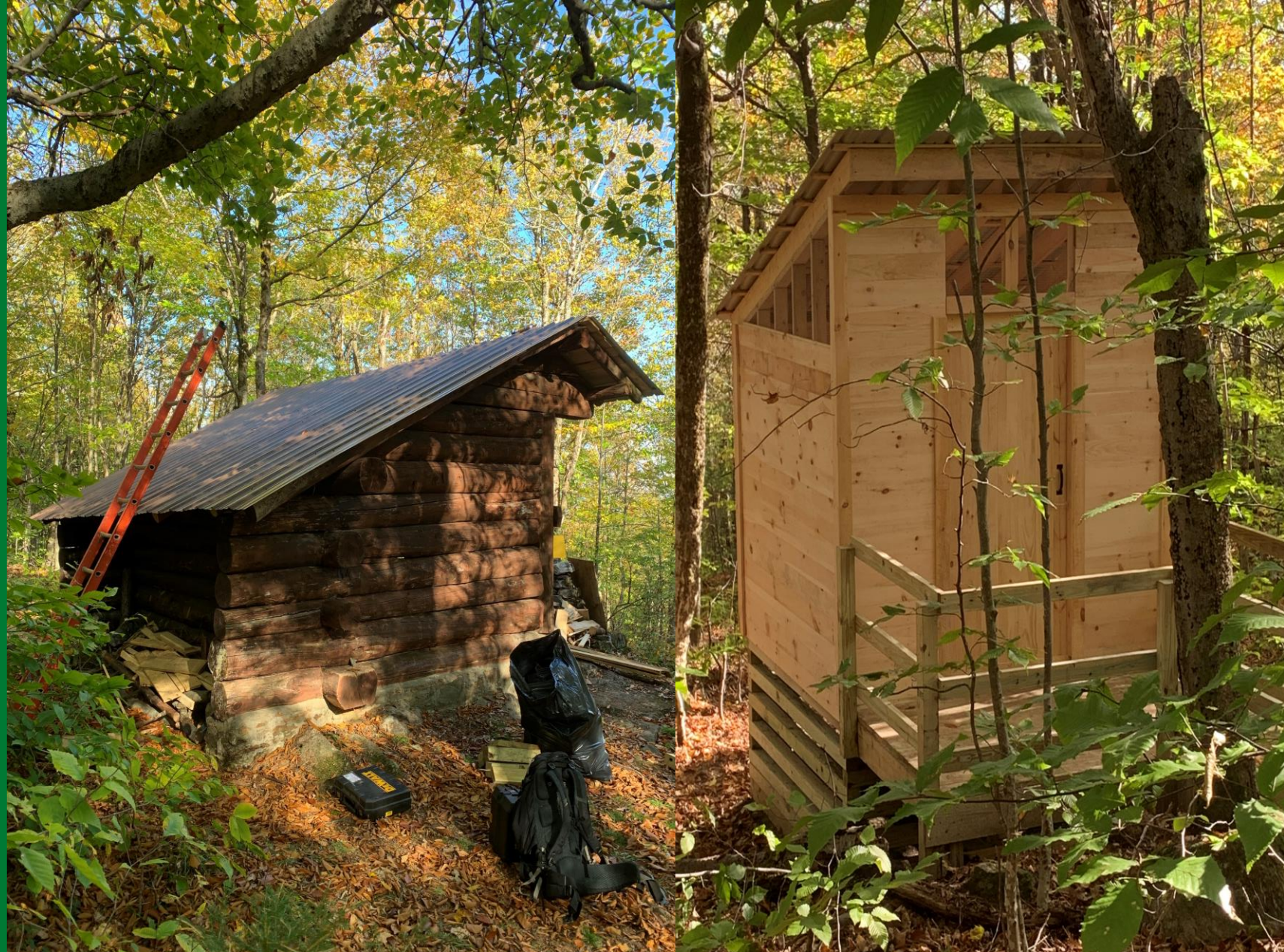
Coolidge State Forest, West - Russell Hill shelter roof repair and privy replacement